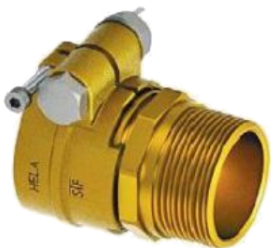
PEX terminal connector