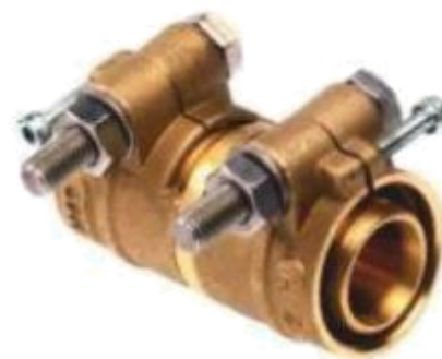
PEX to PEX connector